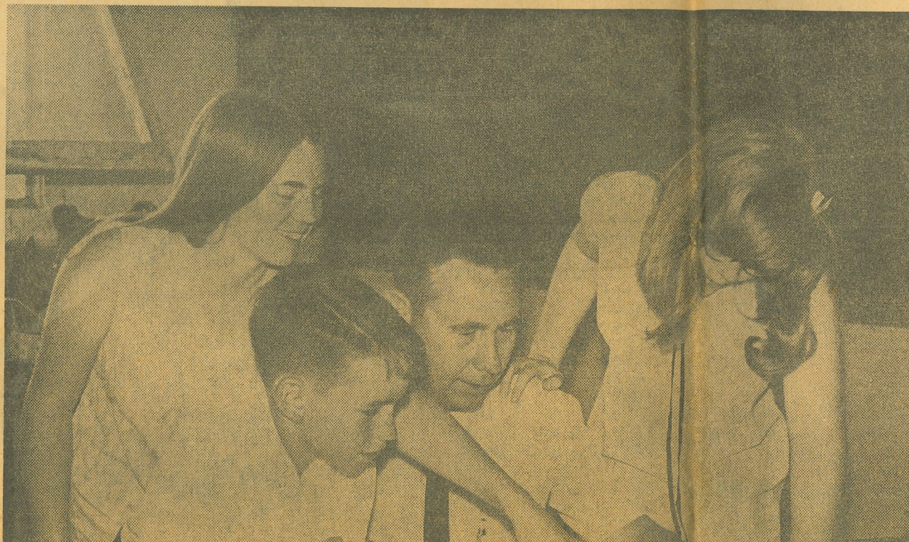
RIGHT: Navigation is an important part of fly-