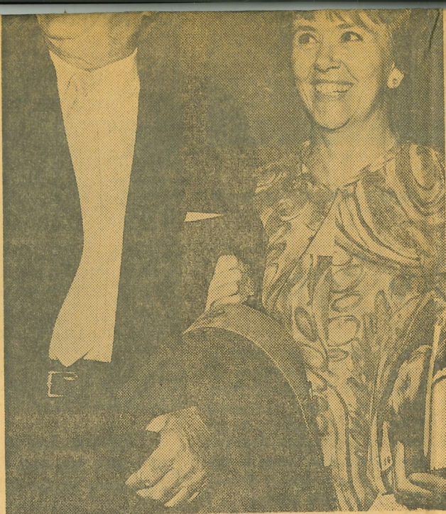
FIRST NIGHTERS Mr. and Mrs. Ed Begley, Van Nuys, arrive by bus to attend Donald O'Connor opening at Greek Theatre. They were guests of Debbie Reynolds and Harry Karl.