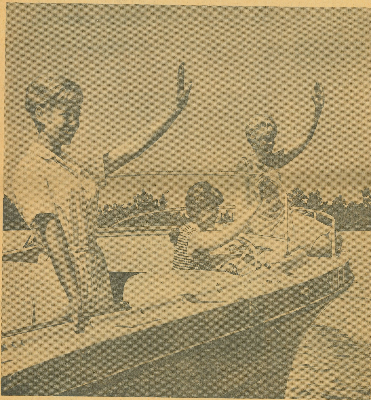
SHIP AHOY and anchors aweigh. It's time for Twins and Triplets Mothers Club seafaring party aboard the SS Princess Louise at Ports O'Call Vil-